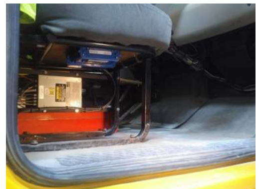
CTM-ONE garbage truck install

Reliably track, monitor and control assets to improve productivity and fleet safety in one single platform.