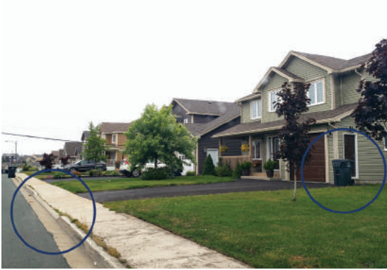
Example of No Bin photo