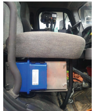
CTM-ONE salt truck install

It includes all the same hardware and functions as the regular CTM-ONE and features a discreet grey colour to blend in on vehicles.