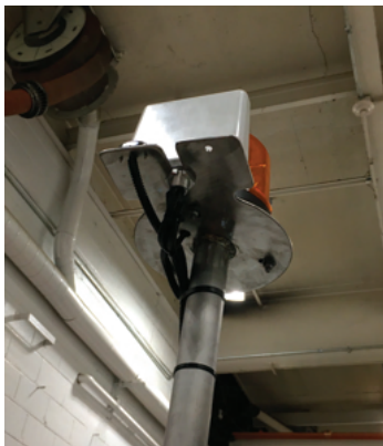
CTM-ONE Blade tow plow install

The CTM-ONE is built with a variety of data interfaces, advanced power management and GNSS. The wireless gateway can be customized and built to fit your exact business needs. The CTM-ONE has internal antennas and an optional cable cover that provides an extra level of protection. Users can reduce installation time by using a single wire hookup for compatible CAN Bus systems.