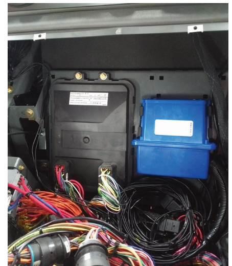
CTM-ONE Elgin Sweeper install

Reliably track, monitor and control assets to improve productivity and fleet safety in one single platform.